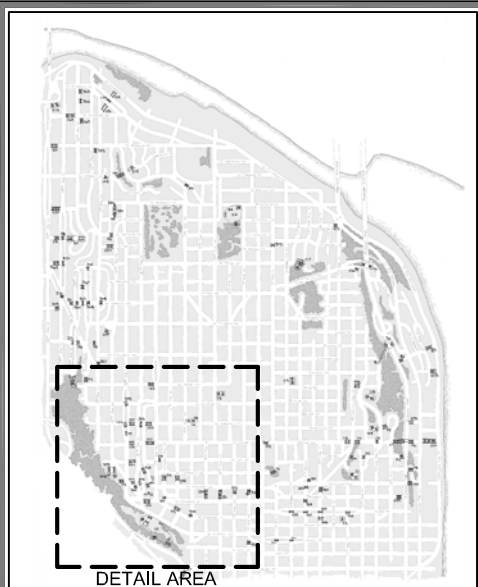
OVERALL MAP OF QUEEN ANNE HILL

- Don't Miss - The Galer Crown (472) the highest stair on Queen Anne Hill! - Reminder - 5 Spot (1502 Queen Anne Ave N) is always a solid choice, breakfast, lunch or dinner. - Did You Know - Queen Anne High got it's mascot from a Grizzly Bear that was spotted on Queen Anne Hill.