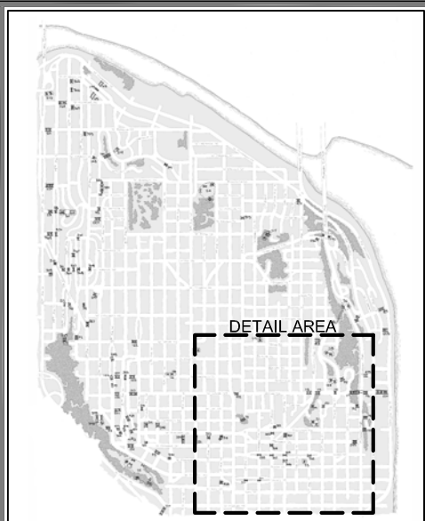
OVERALL MAP OF QUEEN ANNE HILL

DIFFICULTY LEVEL: 4 ADVENTURE RATING: 6.8 NUMBER OF STAIRS: 9 ELEVATION GAIN: 249 FEET