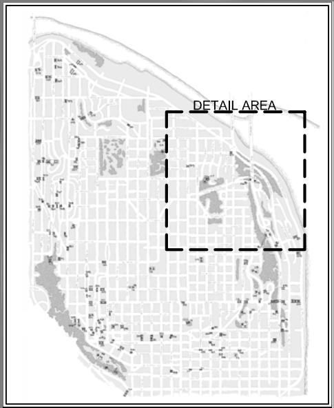
OVERALL MAP OF QUEEN ANNE HILL

DIFFICULTY LEVEL: 3 ADVENTURE RATING: 5.9 NUMBER OF STAIRS: 3 ELEVATION GAIN: 170 FEET